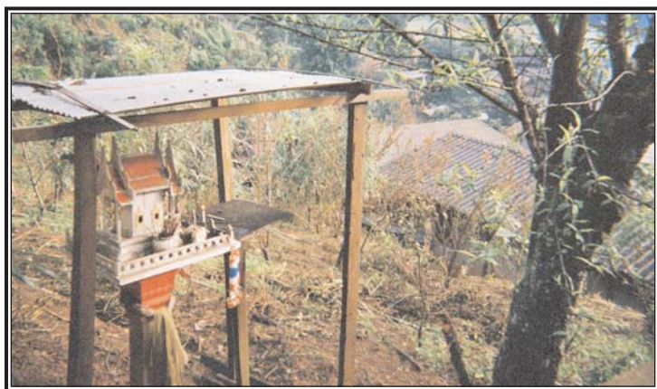
Typical Thai Buddhist house altar