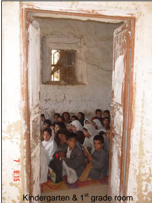
Kindergarten & 1 st grade room