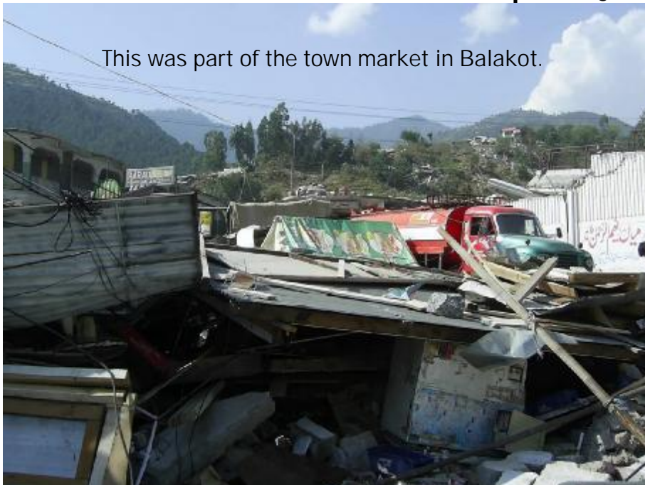
This was part of the town market in Balakot.

The BBC reports over 2000 aftershocks in the past couple days alone. One of our teams, sleeping on a mountainside, between days of delivering emergency medical care and helicoptering serious cases out, spoke of aftershocks every 15 minutes through the night. In one location, days after the quake, our team and another team pulled out of an area because the ground just wouldn't stop shaking.