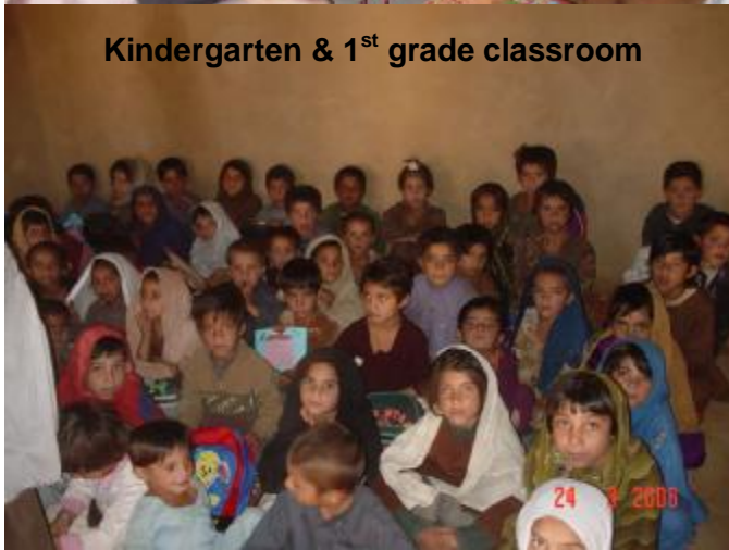
Kindergarten & 1 st grade classroom