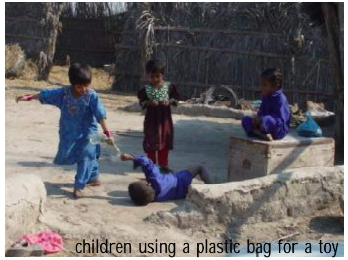
children using a plastic bag for a toy