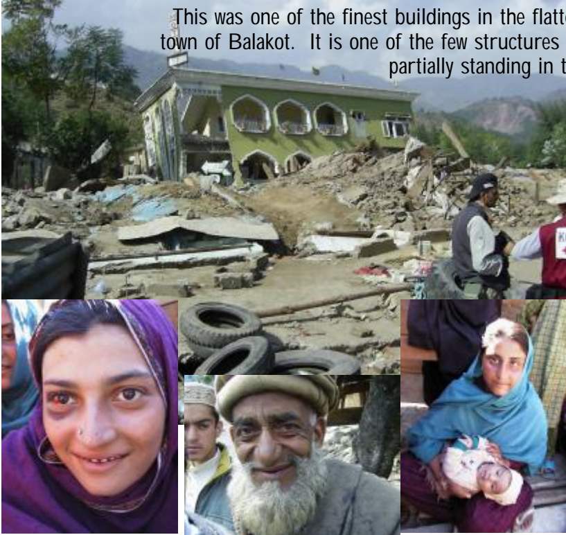
This was one of the finest buildings in the flattened town of Balakot. It is one of the few structures even partially standing in town.